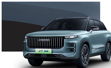
Ocean Blue with Carbon Black Roof*