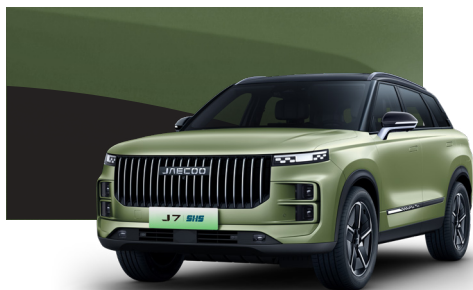
Forest Green with Carbon Black Roof*